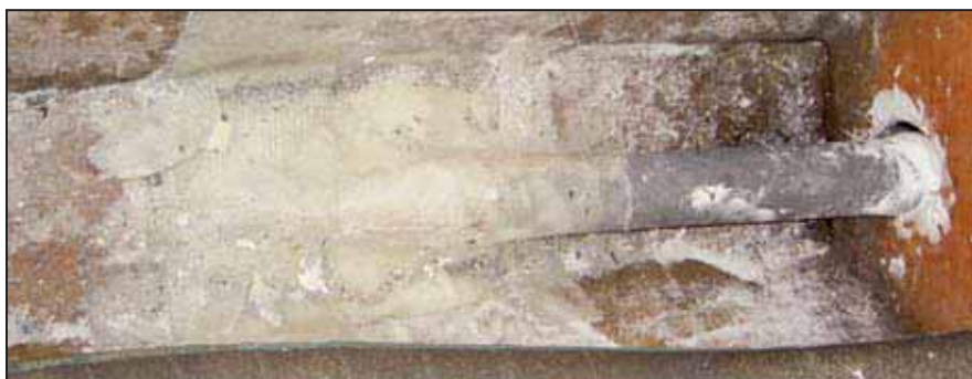
(left) Overlength stern tube ready for epoxy putty and fiberglassing. (right) Trimmed stern tube. (bottom) Stern tube fiberglassed in place on inside.