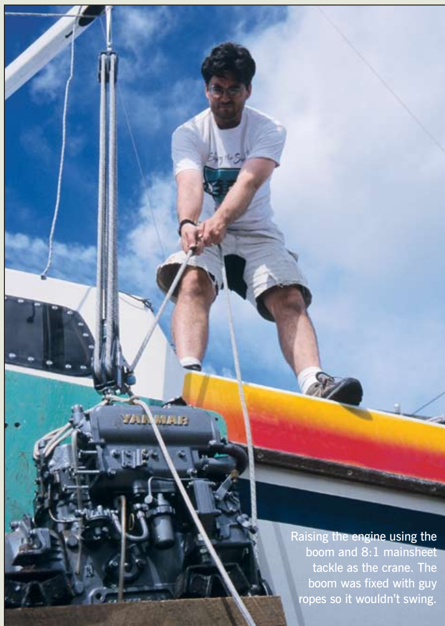
Raising the engine using the boom and 8:1 mainsheet tackle as the crane. The boom was fixed with guy ropes so it wouldn't swing.