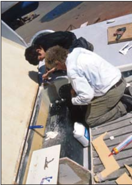
Installing the fuel tank and fittings.

was launched. Once we were satisfied that the alignment was right, we installed the flexible coupling. Since we had a dripless shaft seal, we needed to “burp” the seal to make sure there was no trapped air. With a convention-