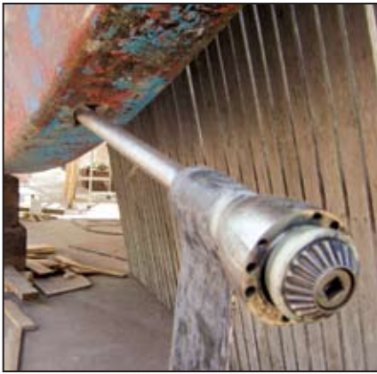
Propeller shaft initial fitting and marking for strut.