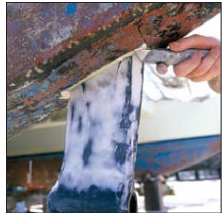
Trimming excess foam shims at the carbon fiber cutlass bearing strut prior to shaping fairing compound.

The final shaft alignment, adjusting the engine alignment by sliding feeler gauges between the shaft coupling and the gearbox, was done after the boat