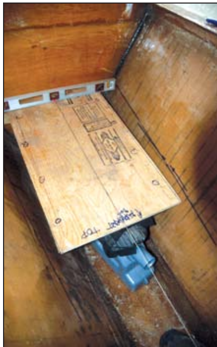
(left) Checking shaft position with laser level. (right) Engine mockup in position to locate engine beds. On this engine, the mid-point of the adjustable engine mounts lined up almost exactly with the gearbox output flange. If they were lower, we would have had to make a wooden support at each end of the plywood to position the reference wire.