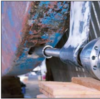
Stern tube and strut in position.

hull bottom. We moved the strut out of the way and cut an oversize hole in the bottom of the hull as a pass-through for the strut.