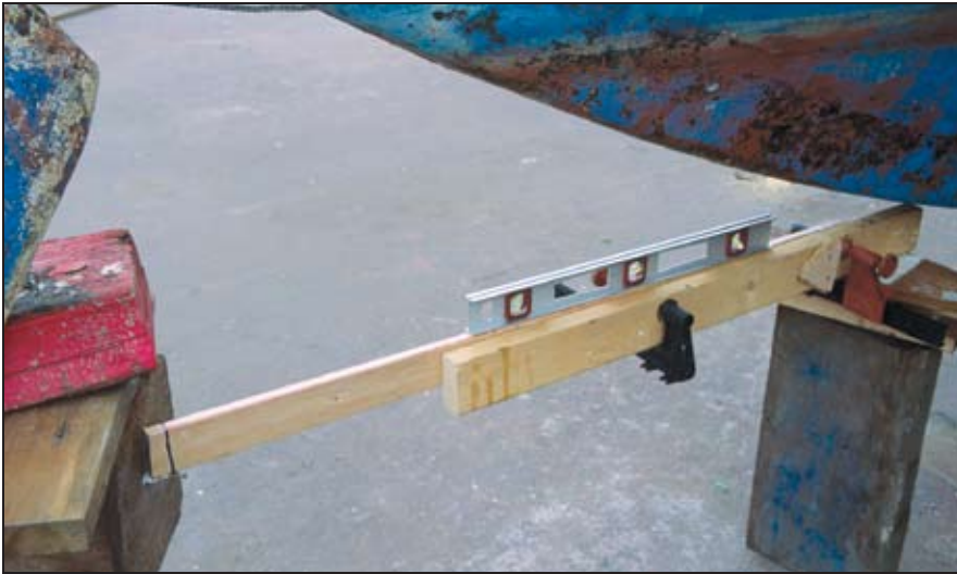
Measuring the spot on the hull to locate the hole for the shaft reference wire.