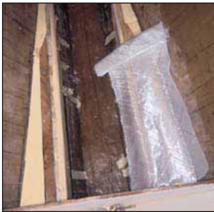
(left) Measuring fiberglass to cover the engine beds. (right) Applying peel ply to the fiberglass to leave a smooth appearance.

reference locations, making sure the propeller tip clearance still matched the drawing.