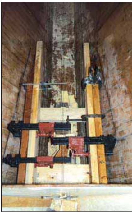
Engine beds glued together and clamped in position while the epoxy putty sets.

reference locations, making sure the propeller tip clearance still matched the drawing.