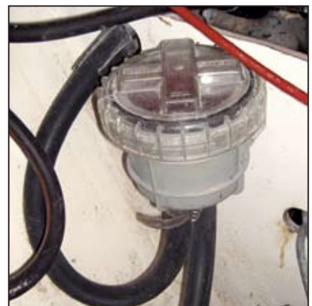
Vetus sea strainer on raw-water intake mounts to bulkhead.