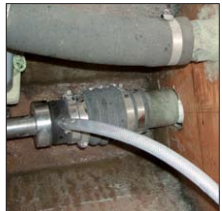
Shaft seal with vent hose and exhaust hose outlet, which has to pass through a watertight bulkhead so the connection is made through a fiberglass pipe glassed to the bulkhead.