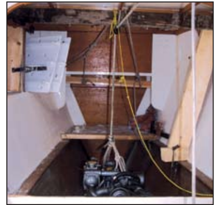
(left) There wasn't enough height over the engine for a block and tackle, so a lifting rope was lead through a block to a winch outside on deck. The overhead lifting beam was suitably braced. (right) Engine on the beds.

Using wood wedges, we adjusted the propeller shaft so that it was centered at both ends of the stern tube. We deferred installing the flexible coupling between the gearbox output flange and the propeller shaft flange because it would flex too much while we located the final shaft position.